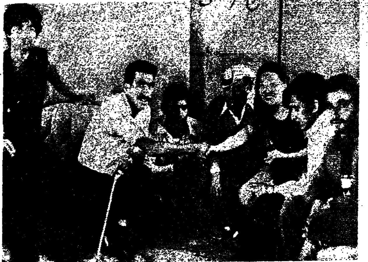
JAPANESE ANARCHISTS AND ARAB TERRORISTS: Fusako Shigenobu, third from right, together with members of the P.F.L.P. terror group in a camp in Lebanon. Another Japanese is on the left.

These pictures, reprinted from "Ma'ariv," indicate that Miss Shigenobu is the mysterious Miss June, who acted as liaison officer between the Japanese extremists and the Popular Front.